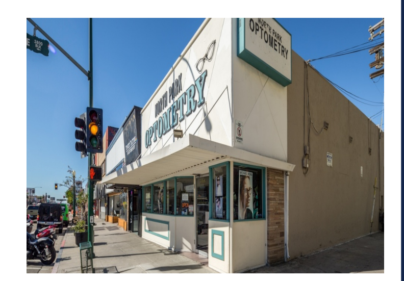
Contact Listing Agent

Price $2,000,000 Property Type: Retail, Street Retail Listing Type: Sale 3480 sq ft Area: This is an investement Property Property use Construction status Existing Cap rate 5.01% Space leased 100%